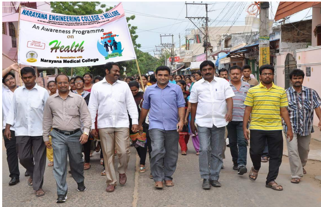
Staff and students of NECN participating in World Health Day Rally.