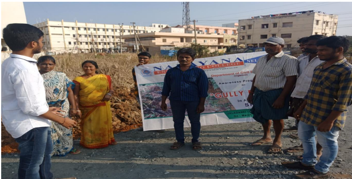
Staff Explaining the need of Gully Plugs