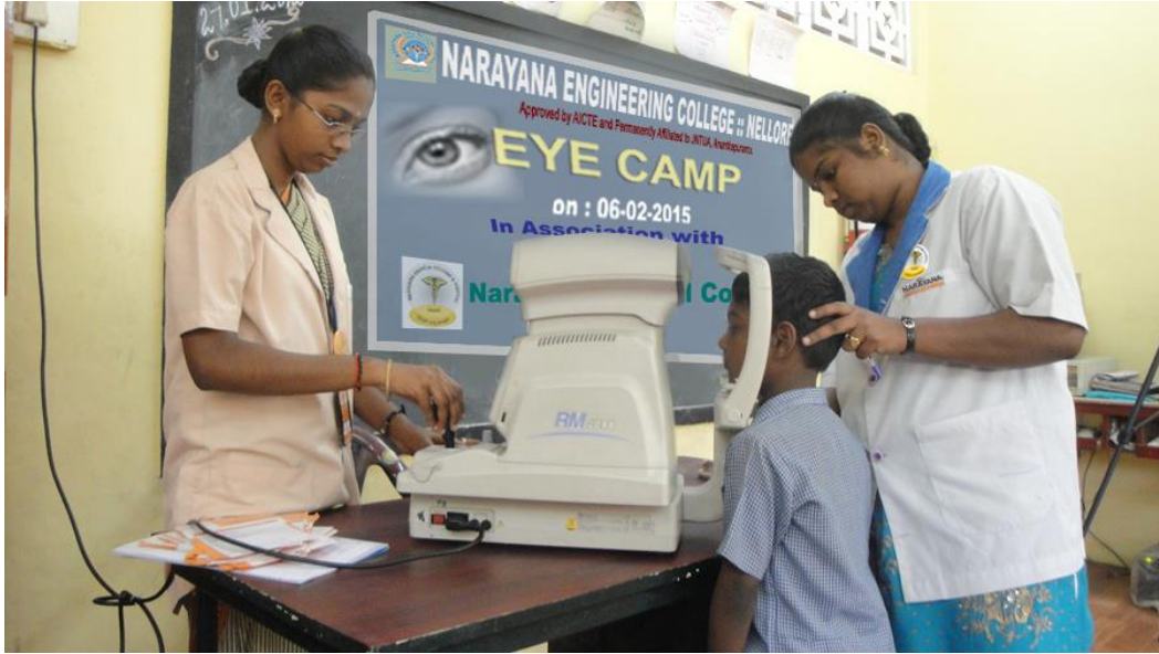
Doctors examining the villagers of Kovuru Mandal, Nellore