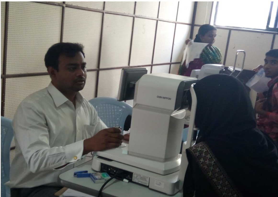
Narayana Medical College & Hospital Doctors examining the villagers of Kovuru Mandal, Nellore in caravan.