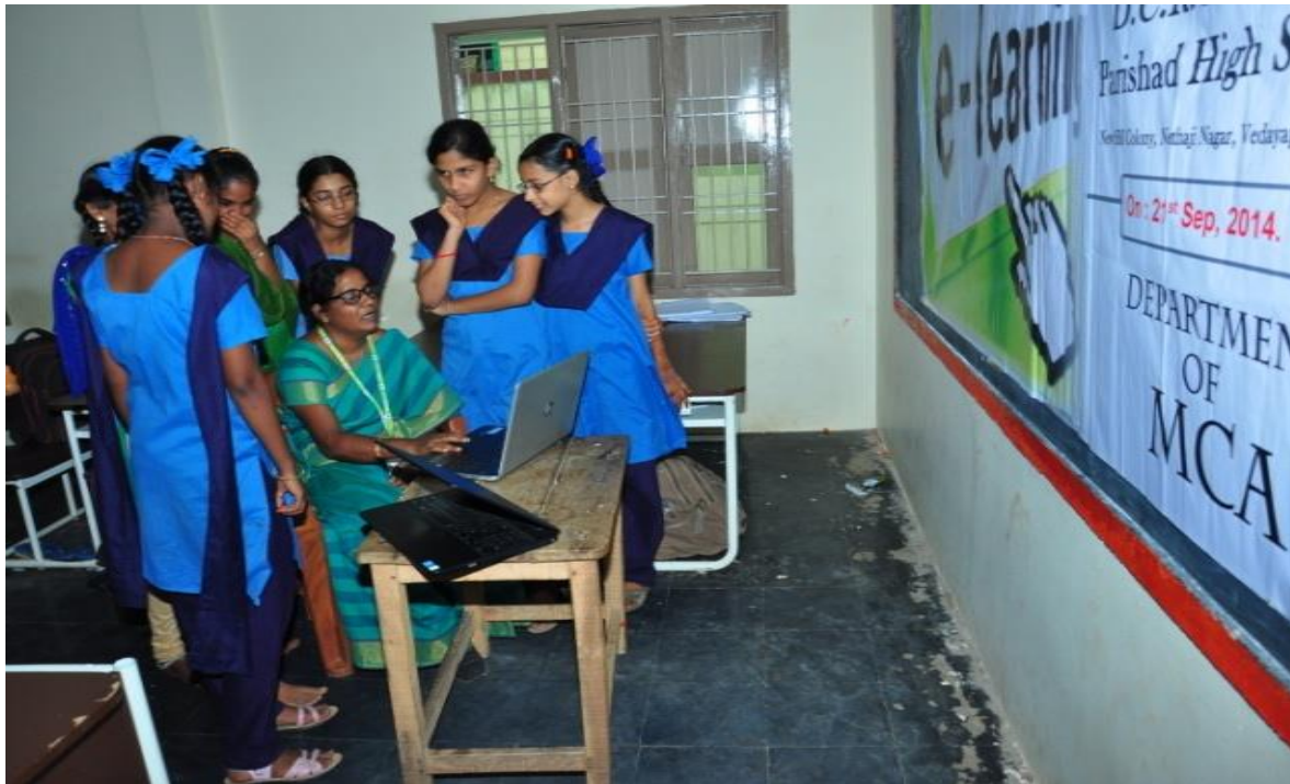
Faculty giving demo on e-resources to the school students.